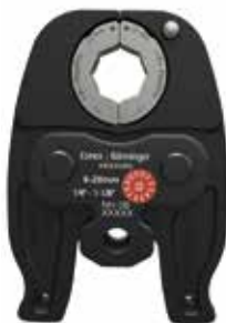
Mother jaw with interchangeable insert